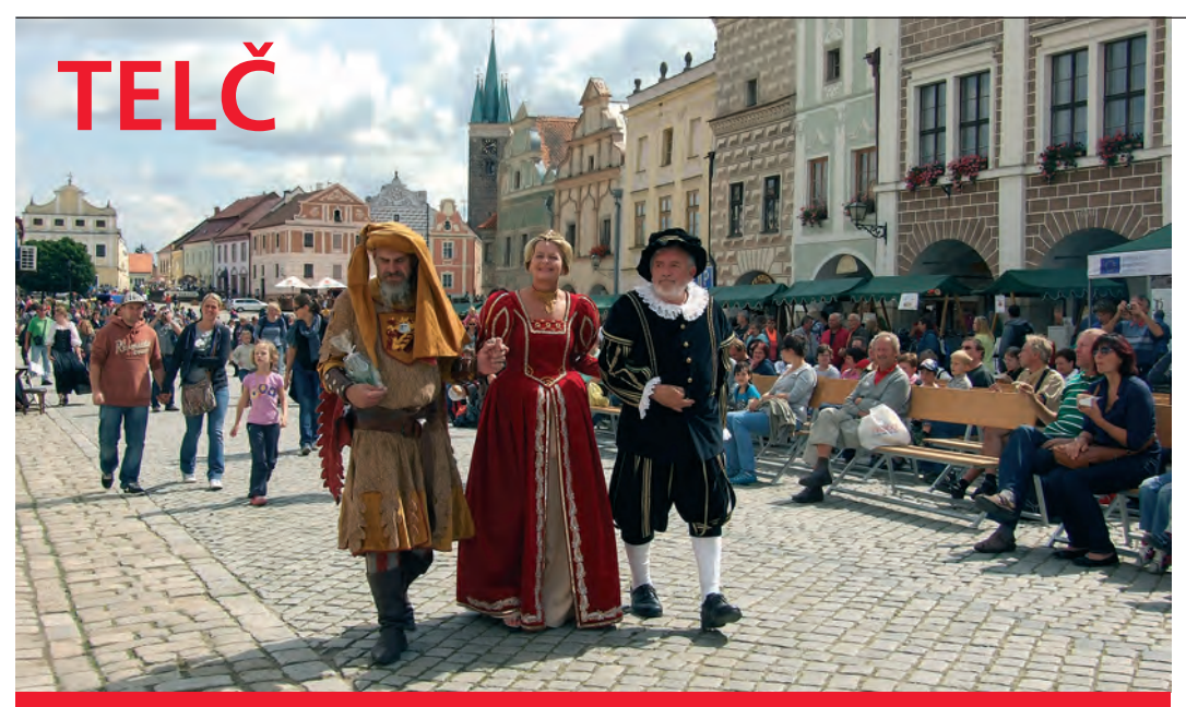
THE HISTORIC CENTRE The centre was inscribed on the UNESCO World Cultural and Natural Heritage List in 1992.

This picturesque town in the middle of the Bohemian-Moravian Highlands, located 30 km from the Austrian border and midway between Prague and Vienna, entices visitors to enter a long-forgotten era. The town offers visitors a living encounter with all the architectural styles of the last millennium. It represents a uniquely conserved architectural complex that is dominated by a Renaissance chateau and square.