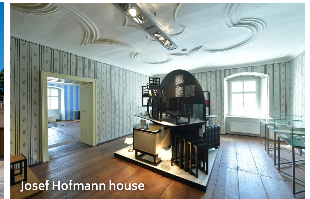
Josef Hofmann house