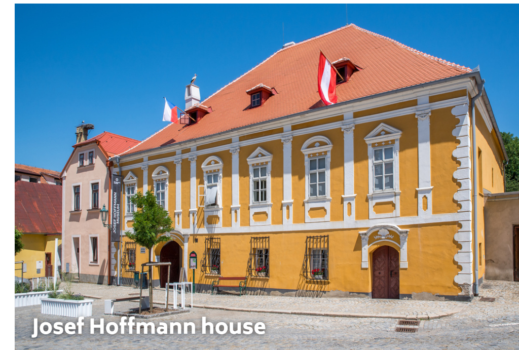
Josef Hoffmann house